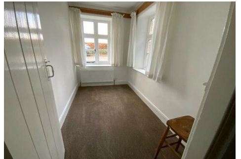
9 the Village , Torrington, EX38 7JQ £950 PCM